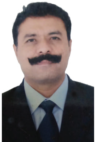
Ishwar Deshmukh Physical Education Indian School Salalah - Oman